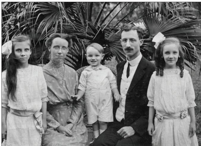
The Tracy Family