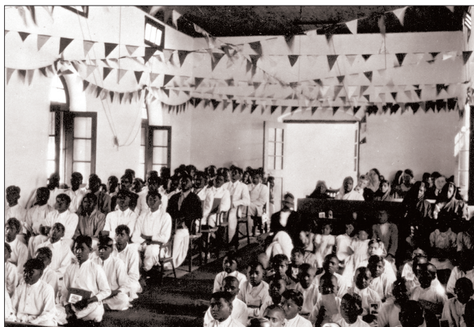
Our church and Christian congregation: Buldana, Berar, India, 1930.